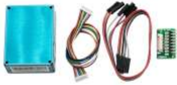
Fig 2. PMS5003 sensor.